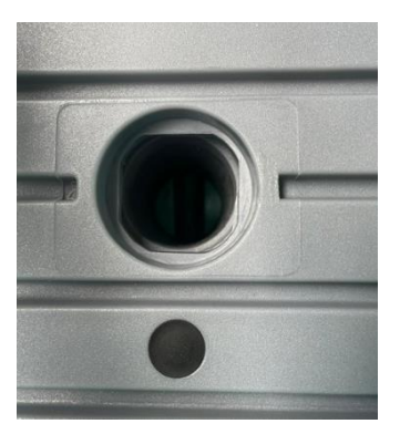
Optional: You can (your Whaly dealer) install an automatic bilge pump to drain the water under the deck / floorplates. Let your Whaly dealer advice you!